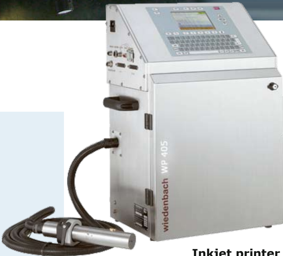
Inkjet printer for dyebased and light pigmented inks