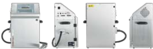
WP Series Wire Processing