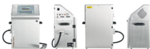
WP Series Wire Processing