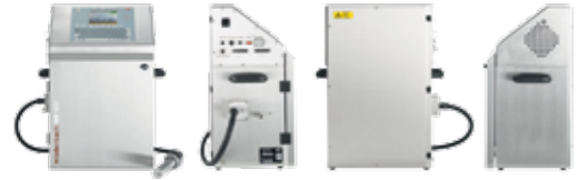
WP Series Wire Processing